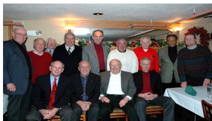
Bowlers on the Club's Two Teams